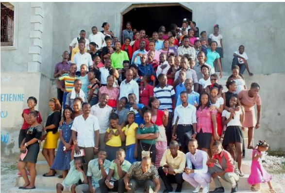
Despite the ravages of political unrest and lawlessness, the church at Carrefour is growing.