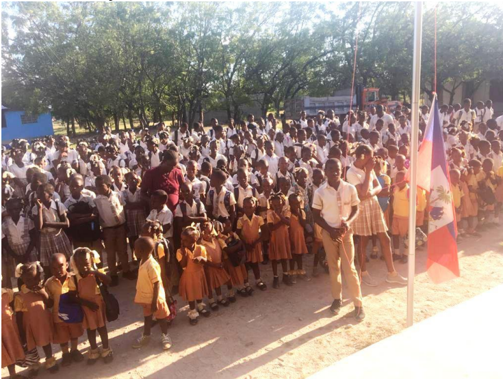
Raising the flag start the school day at Fonfrede.

In the area of education, a whole lot has been accomplished in Christville: Several hundred of children enjoy the bread of education. We offer a Christ centered education. The bible is being taught and tested for as any other subject in Christville. Our school starts every day with the raising of the flag and the reading of devotions. For the past school year of 2020, we sent 16 students to take the ninth grade official state exam, 15 of them were successful and they will leave the school to further their education elsewhere in Les Cayes. On the other hand, we have 50 students