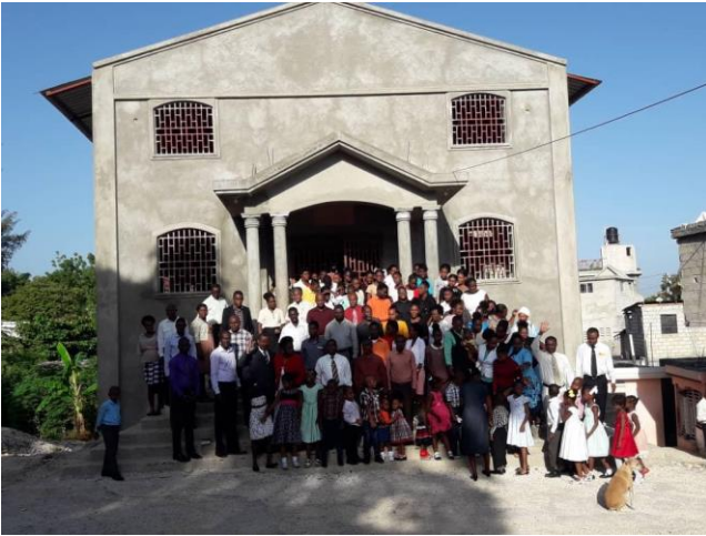
Delmas 75 is the largest church in GCMO with a seating capacity capable of serving 1,000 worshippers.

Delmas #75 - The Congregation is thriving for excellence. After 16 years and the humble beginnings, we begin to see some shape of what was shapeless and void: The balcony is almost complete. The windows were installed and the tile work was done to perfection. Moreover a PA system was recently installed. So much has been invested in order to improve the structures of the building; but there is still a whole lot to do.