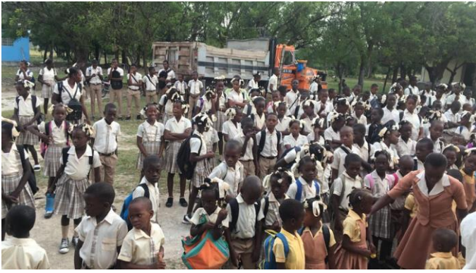
Thanks to the generosity of the Main Street Christian Church and our loyal supporters, we are able to feed our school children a hot bowl of rice and beans for lunch.

hundreds of children are attending school this school year 2021. They are learning about our Lord and Savior and they are being served a hot meal every day. Most important all, we are reaching out to the multitudes with the message of the cross through a plethora of churches you have helped to plant in diverse communities. We pray for you often. And our God is able to make all grace abound toward you; that ye, always having all sufficiency in all things may abound to every good work.