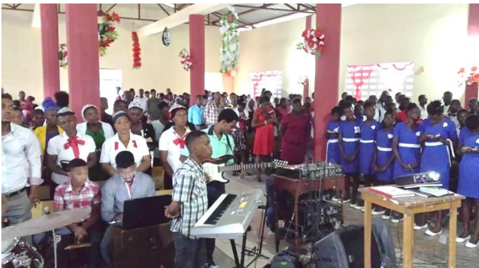
Church services at Christville at Fonfrede.

In this difficult context of violence and chaos, and confusion, our brothers and sisters are putting their life on the line every day in order to know Him and to make Him known. We hear today in this very context an echo of the voice of the apostle, "But none of these things move me, neither count I my life dear unto myself, so that I might finish my course with joy, and the ministry, which I have received of the Lord Jesus, to testify the gospel of the grace of God." (Acts 20:24 KJV)