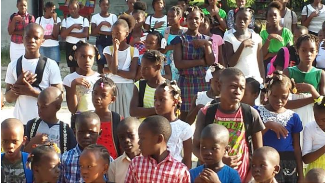
Christville School Children

The congregation was packed to full capacity each evening and the result was fantastic as 15 people accepted Jesus Christ as their personal savior during the week, and a greater number of souls were restored in their Christian faith.