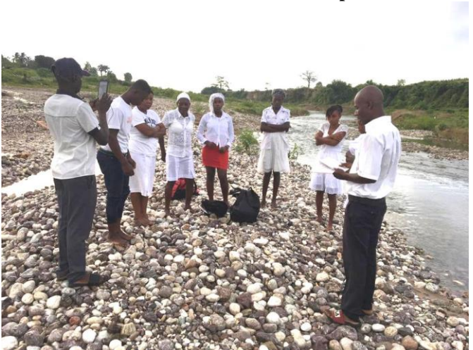
Baptism Service at Christville