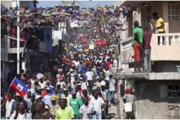
Protests clog city streets and stops traffic for hours.