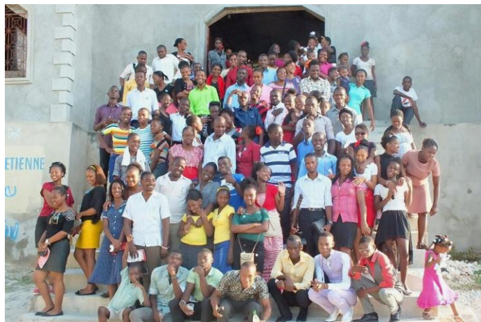
Youth In Action at Carrefour

At Carrefour: Easter celebration started a week earlier in prayer and evangelism. The congregation prayed for Haiti and the world in the morning and they reached out to their community in the evening. A revival was launched to that end around the theme, The Urgency of the Hour; "Therefore, since we are God's offspring, we should not think that the divine being is like gold or silver or stone - an image made by human design and skill. In the past God overlooked such ignorance, but now He