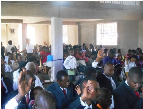
Worship at Delmas 75.

The gospel according to Luke spent tremendous amount of time in the immediate environment in which the crucifixion was taking place; “It was about noon, and darkness came over the whole land until three in the afternoon, for the sun stopped shining.”