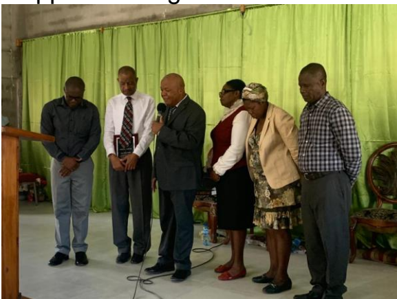
Good Friday Service at Delmas 75

phenomenon of day and night was created. Therefore, the sun was ashamed to contribute to that horrific injustice and suffering. It just stopped shining.