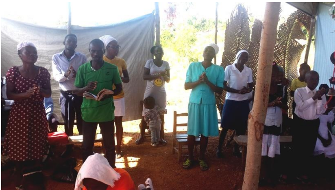
First Church Service at Prosper