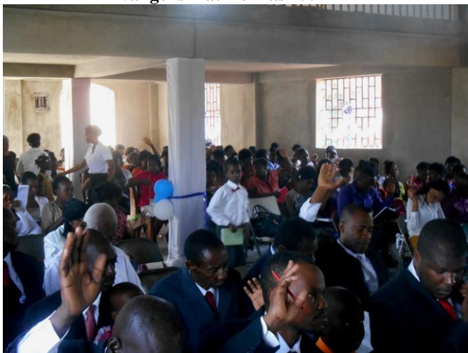
Worship at Delmas 75!