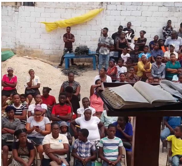
Evangelism at Delmas 75!