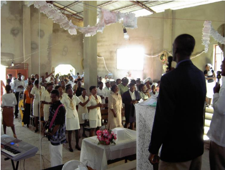
Wearing one's Sunday's best clothing can bring unwanted attention to members of our congregations.

The Haiti Christian Congregations of Delmas 75, Carrefour, Fonfrede, Cambry, Saut-D'eau, Jeremie & Tom Gato GCMO-Haiti.org - August 2021