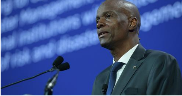
The late President of Haiti, Jovenel Moïse

Here in Port-Au-Prince, as the bloodshed continues, the crisis has taken a turn for the worse. President Jovenel Moïse has been assassinated and the First Lady severely wounded.