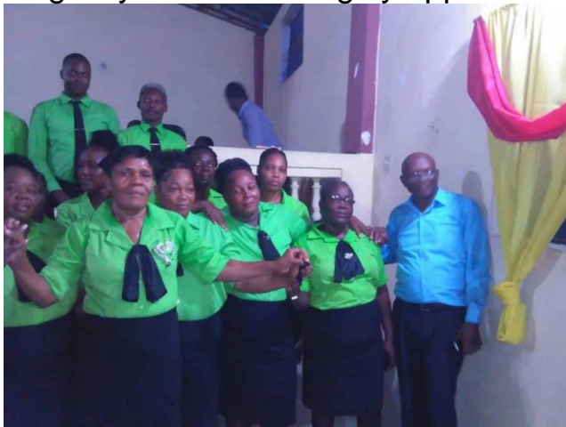
The Choir at Carrefour

The church in Laval is also moving forward. There was a campaign in Cambry to marry all those who are living together outside of the holy covenant of marriage. The campaign was very successful; five couples were united in holy matrimony on May 25 of this year. Seven others are already on a waiting list for next December. We encourage you to make a donation toward that end. They are people who can't afford to get married. A gift of any kind to help in paying for the ceremonies will go a very long way and will be highly appreciated.