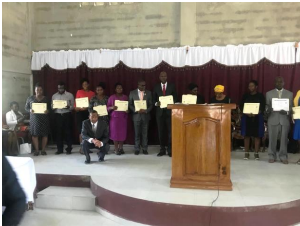
Special recognition for the leadership and staff of Delmas 75

field in Delmas. The theme for the week was, "Hurry up! The Door IS Going to Be Closed" A great crowd stood for hours to hear the gospel message every day from 4:00pm to 6:00pm. Twelve people accepted the gospel message and more than 15 came forward to pray for restoration. This is the good news of the hour in the midst of chaos and violence and assassination.