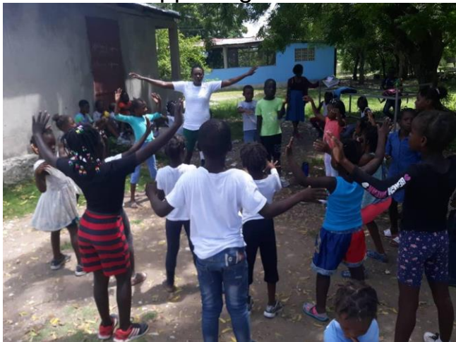
Vacation Bible School at Fonfrede!

And the Lord continues to add to His Church those who are being saved. The congregation of Delmas continues to experience steadfast growth. We praise the Lord for what is happening in Delmas even during this time of crisis.