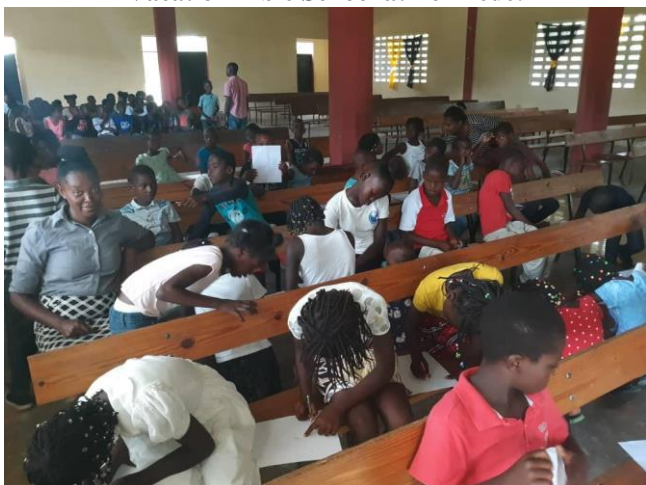
Over 200 children are studying the Bible at Christville's Vacation Bible School.

The Lord began to shape what was shapeless and to fill what was previously void. Our territories have been enlarged here gradually. After the days of a very humble beginning, today the Faith once transmitted to the Saints has been strongly implanted at Christville. The Church and its emerging school are the centers of all social life in the community. Even as I am writing this newsletter, there is a Vacation Bible School