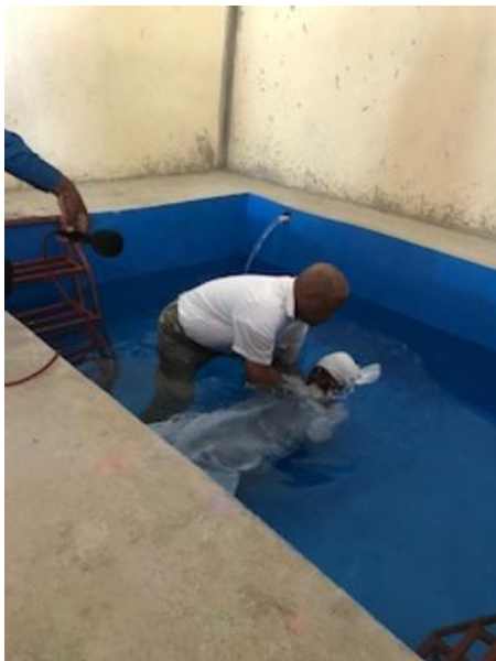
Baptism at Christville.

In spite of the chaos and confusion, the work of the kingdom is moving forward in Christville. The gospel is being preached to the multitudes, children are being kept in classrooms, Thanks to the generosity of our brothers and sisters of Main Street Christian Church and faithful partners like Masters' Hands. The children are being served a hot lunch every day, and a plethora of young men and women who were held in bondage experience abundant life in Christ. And the Lord kept adding to His Church those who are being saved.