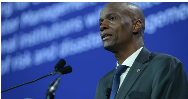
Haiti's late President Jovenel Moise.

Here in Haiti, nothing seems to be new under the sun. The same challenges still stand before us and the political and social tensions are still being greatly felt. Seven months after the assassination of the late president Jovenel Moise, very little has been done to bring the criminals to justice. Three judges have already rejected the case. Meanwhile, more politicians kept fighting for positions to better serve themselves. They want at all cost to share the power with the Prime Minister Ariel Henri. But in fact, they are still more of the same.