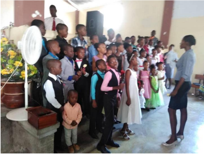
Children's Choir at Carrefour