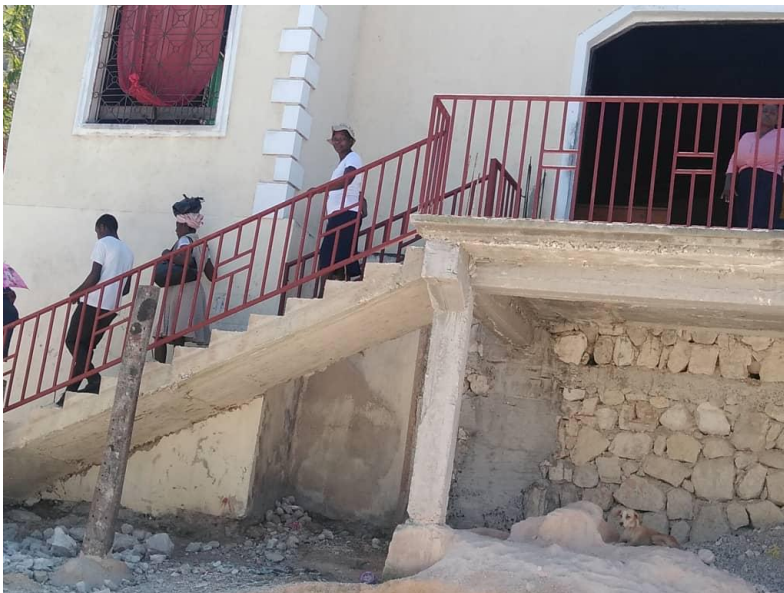
Newly reconstructed entrance to the Church at Carrefour.