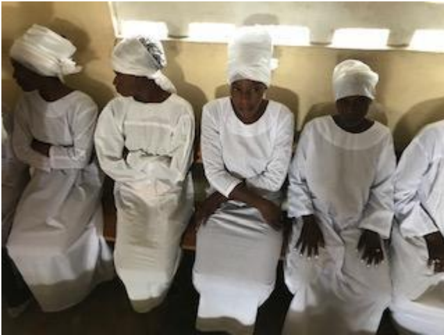
New names for the Book of Life awaiting baptism at Christville.