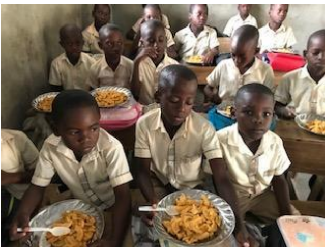
GCMO continues the school lunch program at Christville School in Fonfrede.