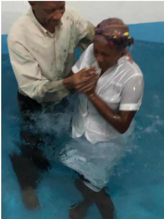
Baptism at Delmas 75.

Goave, Petit Goave, Leogane, Carrefour and Gressier. Gangs are ever present everywhere holding their machine guns and are ready to prey on a defenseless population. Our freedom of moving freely from one point to another is severely restricted. We are engaged in a war against ourselves. We do not really know what tomorrow holds for us but we know for certain who holds tomorrow.