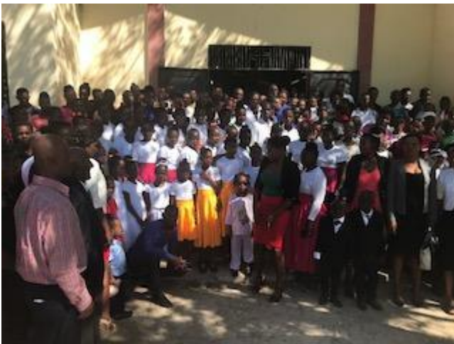
Wedding celebration at Christville when four couples were united in holy matrimony.