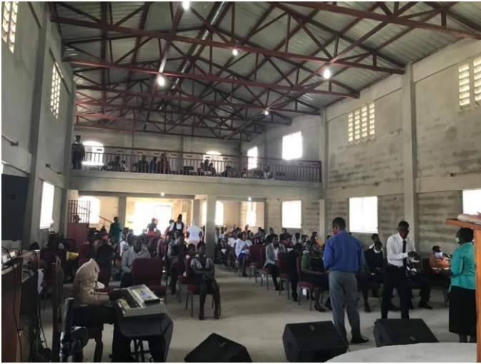
Worship service at Delmas 75. Even in this time of lawlessness, the church continues to grow.

moving to a new level and to witness firsthand, what God is doing in the South district of Les Cayes. To God be the glory!