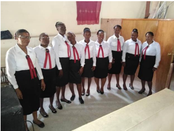
Carrefour Ladies' Group.