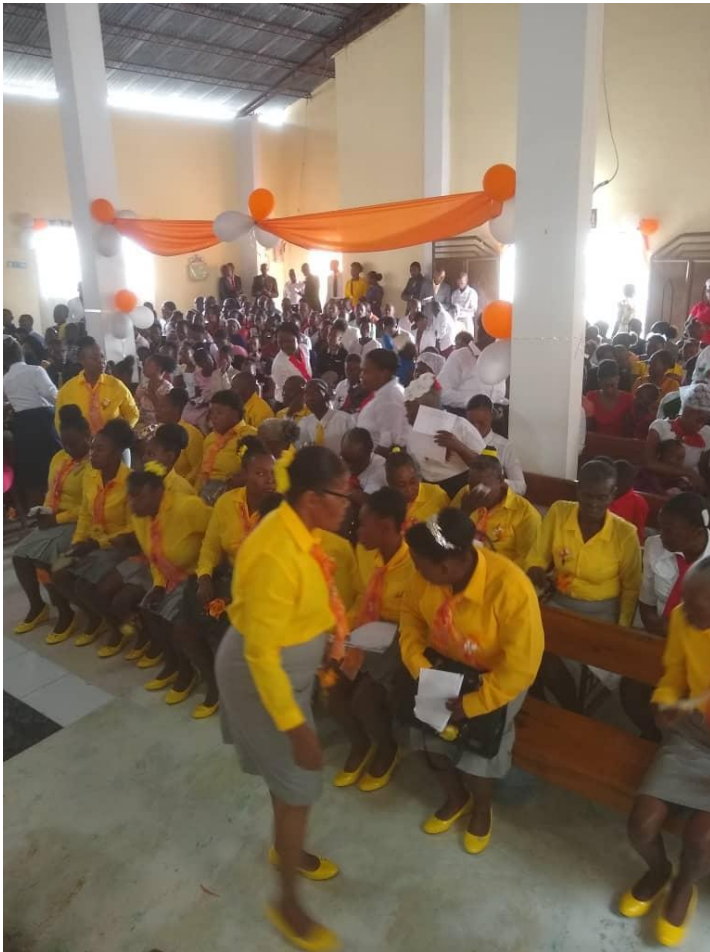
Worship service in March of 2022 at Carrefour.