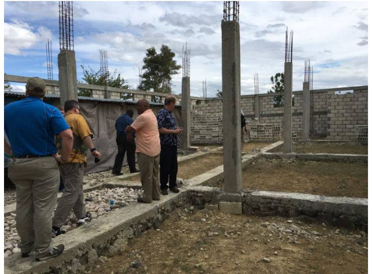
Piers and footers of the new church at Saut-d'Eau 2018

personnel Savior. On Sunday 27, at the closing of the revival seven people were baptized and a dozen infants were presented to the Lord. We praise God for what He is doing in the life of the people of Saut-d'Eau.