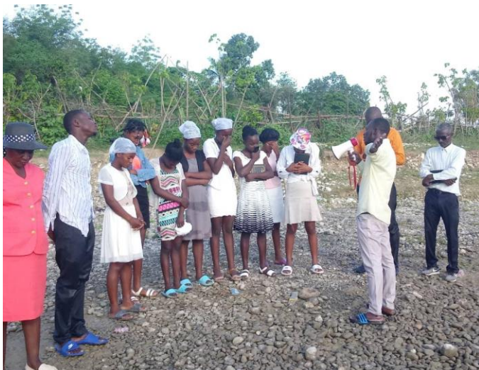
Baptism at Saut-d'Eau

We have recently poured the concrete floor at Saut-d'Eau. But there is still a whole lot to do. For the time being, the metal roof is the most urgent need they have.