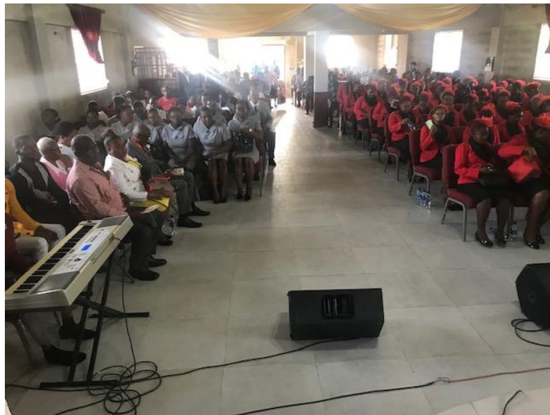
20th Anniversary of The Church At Delmas 75!

The result was astonishing: More than 480 persons heard the Gospel message and 56 people accepted the Lord as their personal Savior.