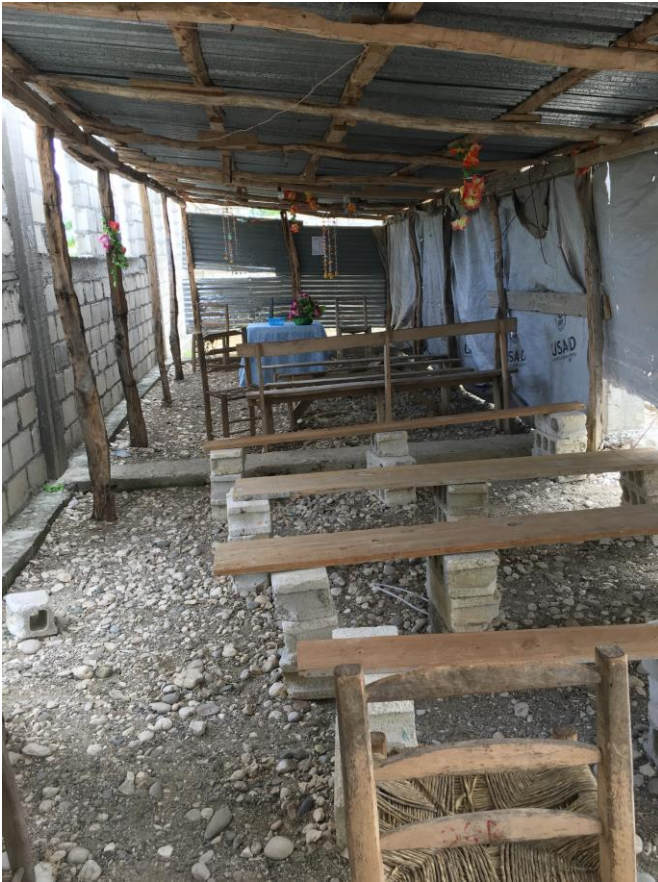
The old church at Saut-d'Eau

personnel Savior. On Sunday 27, at the closing of the revival seven people were baptized and a dozen infants were presented to the Lord. We praise God for what He is doing in the life of the people of Saut-d'Eau.