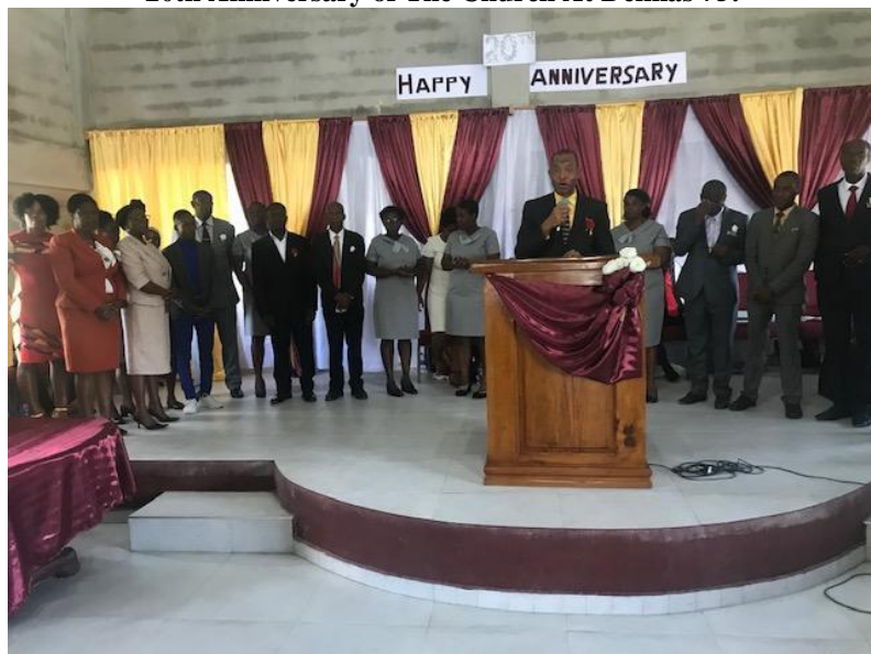
Elders, Deacons and Staff of Delmas 75.

During the last 17 years, we have witnessed tremendous growth in Carrefour. Carrefour now reaches an attendance of more than 400 hundred and the Lord continues to add to His Church all those who are saved.