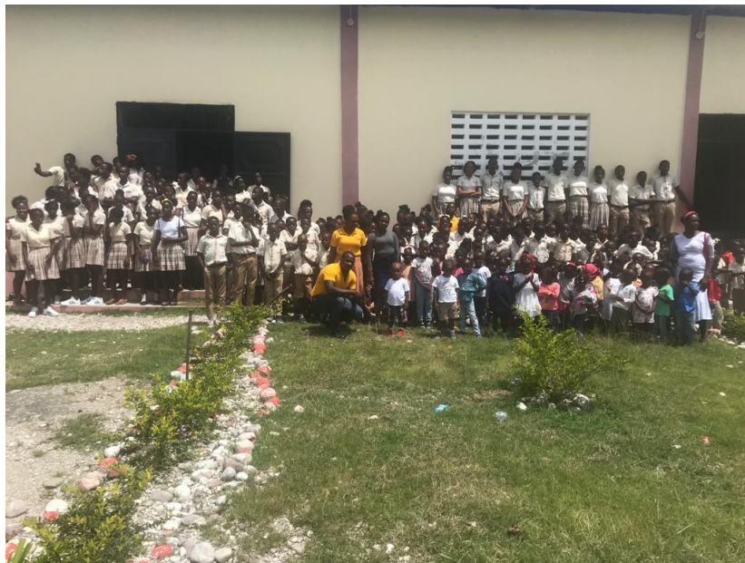
Last day of school at Christville, Fonfrede 2022.

On March 27, 2022, Saut-d'Eau's congregation celebrated their 10th Birthday. For this occasion, a week of revival was organized around the theme, "For a More Dynamic Church." About a hundred and thirty people gathered each night to hear the Word. As a matter of Course, ten young men and women accepted the Lord as their