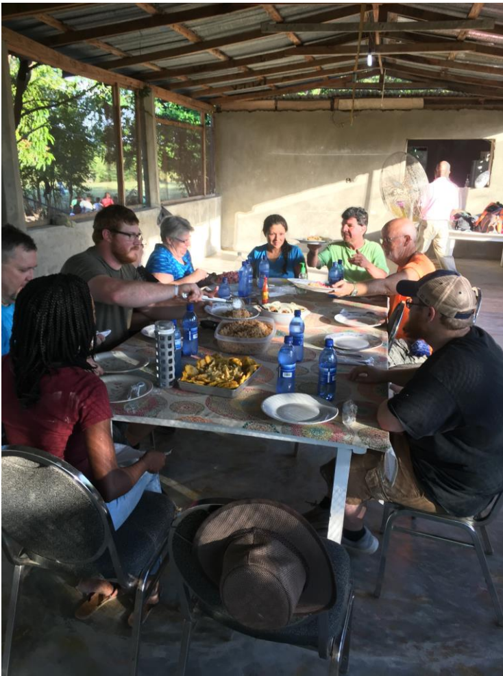
Mission team from Main Street Christian Church in 2019 eating lunch in the cafeteria. The deteriorating roof of the building has been replaced thanks to Master's Hands.

The congregation continues to strive for excellence. Five young men and women were baptized on the last Sunday of February and nine others were baptized on Good Friday of April 2022 which brings the total to 14 new baptisms so far. And the Lord continues to add to the congregation those who are saved.