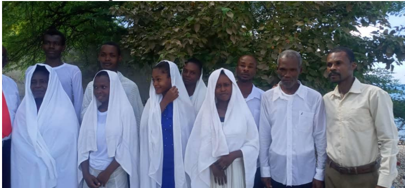
Baptism at Carrefour