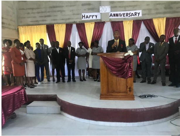
Elders, Deacons and Staff of Delmas 75

November 2, 2022. The result was astonishing: 641 men and women heard the Word, 33 men and women have accepted the Lord as personal Savior, and three others who used to go to church were restored to their Christian Faith and are now active in their respective congregation. Alleluia to the Lord of hosts.