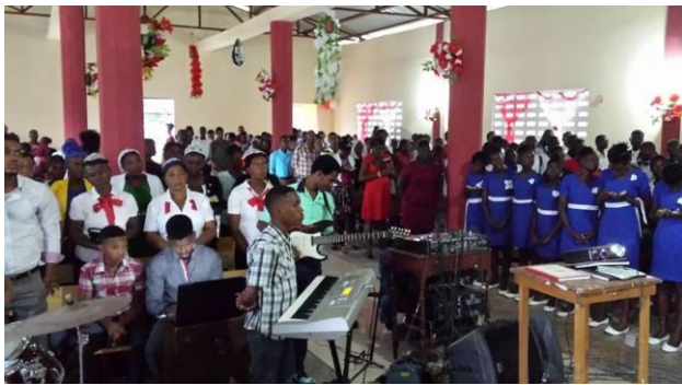
Church service at Christville

November 2, 2022. The result was astonishing: 641 men and women heard the Word, 33 men and women have accepted the Lord as personal Savior, and three others who used to go to church were restored to their Christian Faith and are now active in their respective congregation. Alleluia to the Lord of hosts.