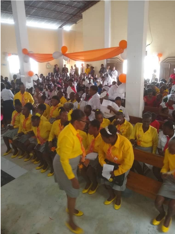
Worship service at Carrefour

Carrefour Christian Church is pressing hard to keep the torch of the gospel alive in Carrefour. Carrefour is without a doubt that city set on a hill. Carrefour definitely continues to shine during this dark hour of the night. Our Lord and Savior said it so well, “Ye are the light of the world. A city that is set on a hill cannot be hid. Neither do men light a candle, and put it under a bushel, but under a candlestick; and giveth light unto all that are in the house. Let your light so shine before men, that they may see your good works, and glorify your Father which is in heaven.” (Mat 4:14-16 KJV)