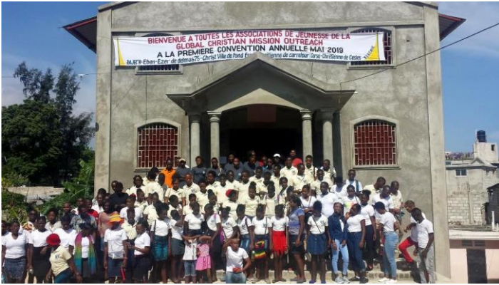
The Youth of Delmas 75

more than 614 were exposed to the gospel message in a public square. On the evening, the population of Saut d'Eau was invited to the Church where they held a revival. The place was packed to full capacity. Most people stood for the duration of the service. About a dozen responded to the alter call. Salvation is coming to Saut d'Eau! We praise God for what He is doing in Saut d'Eau.