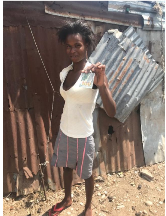
Figure Cambry relief for food.

unjust to forget your work and the love you have shown for His name, caring for the believers as you still do.