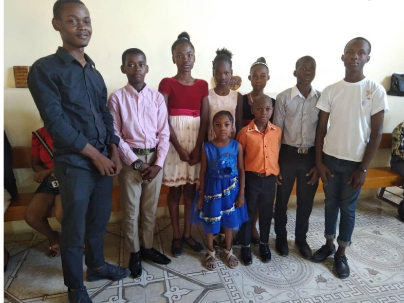
Students sponsored by S.C.H.O.O.L.