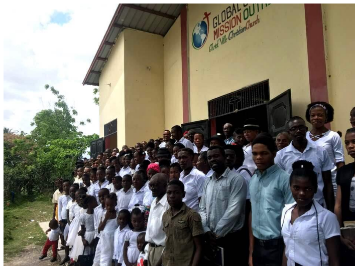
The Youth of Christville