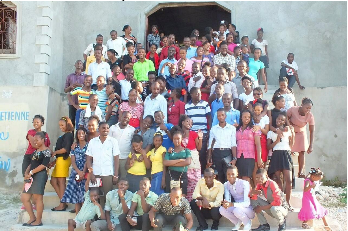
The Youth of Carrefour

early in the morning. They reached their destination after about an hour long rough ride. They stayed over there for about a week; they lived under tough conditions in order to win but a few. They went from house to house in Saut d'Eau presenting the good news of the gospel to a community in despair. They preached in open market places that Jesus Christ is the only solution to a community in crisis. More