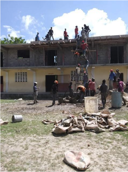
Second floor rooms at Christville School