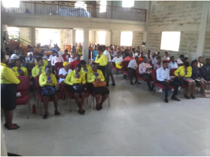
Worship Service at Delmas 75

drunkenness, and sexual immorality. It is high time for us to wake up from our slumberness for our salvation is nearer than when we first believed. The church was packed each night. What an awesome privilege to be the voice of God in such a time like this.