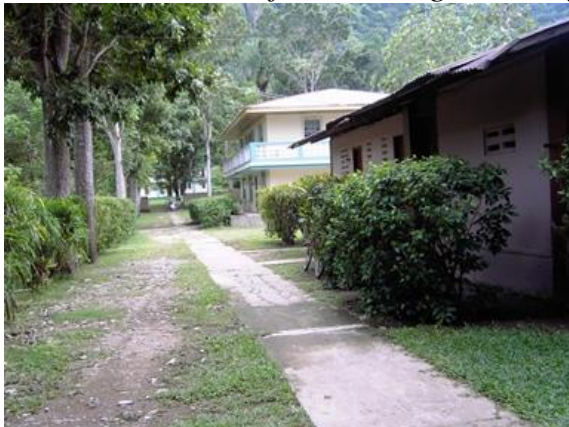
Mission Bonberge at Milo