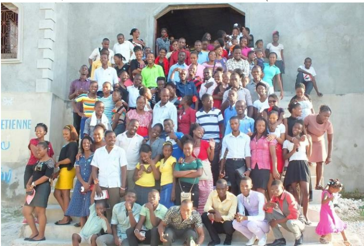
Youth In Action Carrefour

theme, “If my people which are called by my name, shall humble themselves, and pray, and seek my face, and turn from their wicked ways; then will I hear from heaven, and will forgive their sin, and will heal their land.” (II Chronicles 7:14 KJV)