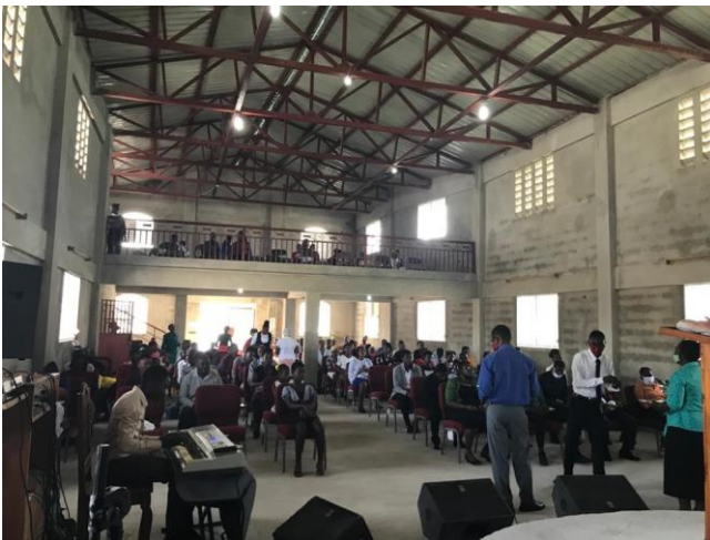
Services continue at Delmas 75!

Many schools in the vicinity of Port-Au-Prince and around Carrefour are now forced to close their doors. Traffic from Port-Au-Prince to other parts of the country has been completely paralyzed. One bus driver who risked it all to venture to make a trip to Les Cayes had to pay toll to four different gang stations amounting to 3,000 Haitian dollars fee for one way. In the absence of all legal authorities, the gangs seem to be the law of the land. Food prices skyrocketed and fuel and pharmaceutical items are lacking. The impact of the crisis is already greatly felt by the most vulnerable at the bottom of all social life. It is a real struggle for survival. We have experienced terrific earth quakes and catastrophic hurricanes in the last two decades, but this crisis we have never seen something of such alarming proportion. We need to do something now before it is too late.