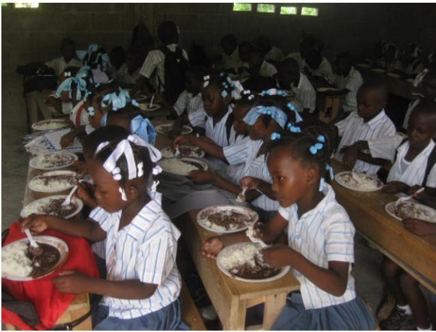
The school lunch program is still feeding our children a hot lunch of rice and beans very school day!