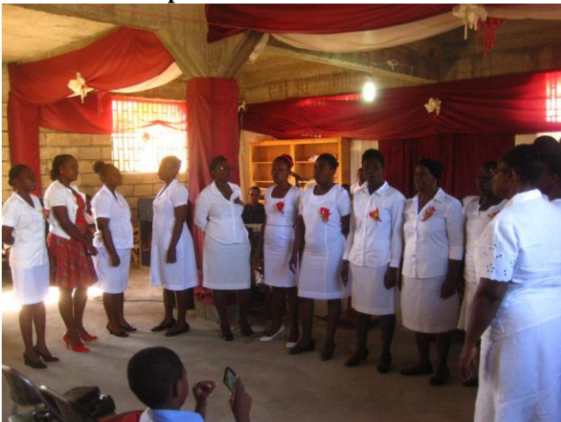
Baptism at Delmas 75!

"The Sevenfold Sprinkling of the Blood of Jesus Christ." Several keynote preachers addressed a congregation hungry and thirsty for the word. On Good Friday, six young men and women were baptized in Christ. They began a whole new adventure in their life following Christ. Easter was celebrated with great solemnity and reverence at Delmas. They used all expressions of the art: poetry, choreography, dancing and singing to celebrate Easter. It was such a solemn event. What a wonderful God we serve. We praise and magnify