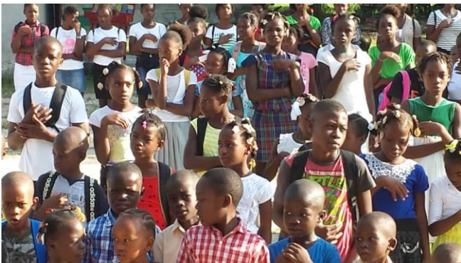
The school children at Christville, Fonfrede!