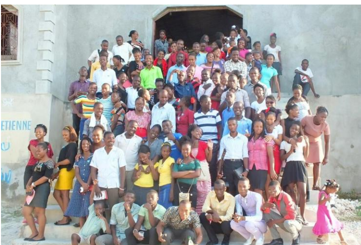
Youth In Action Group at Carrefour!

Carrefour is now located in the very axes of evil. Here, the situation is even more complicated. Hundreds of families in the vicinity of Carrefour were forced to abandon their homes to flee for their life. Many churches have to close their doors included businesses, schools and banks. More than gang activities, it is a reign of terror and indescribable horror words can barely describe. As a matter of course, several of Carrefour Christian Church family has been displaced to live with close friends or